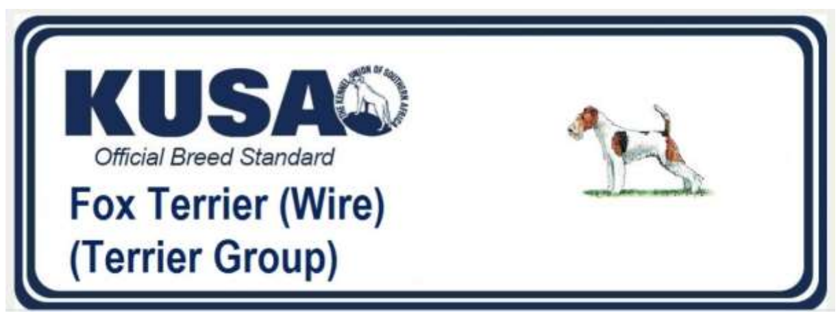
A Breed Standard is the guideline which describes the ideal characteristics, temperament and appearance of a breed and ensures that the breed is fit for function with soundness essential. Breeders and judges should at all times be mindful of features which could be detrimental in any way to the health, welfare or soundness of this breed.